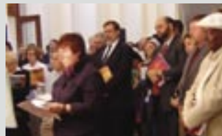
Guests at the Report's launch.