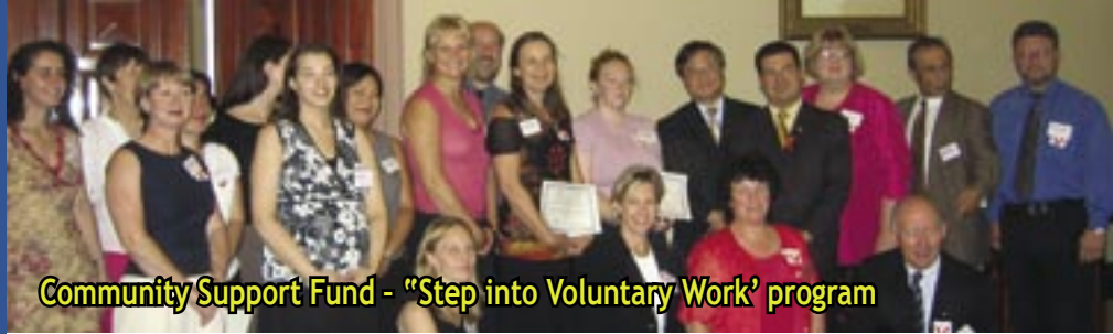
Community Support Fund - "Step into Voluntary Work" program