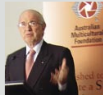
The Hon. Sir James Gobbo, AC CVO, AMF Chairman.