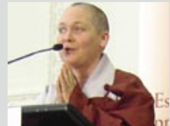
Venerable Chi Sunim.